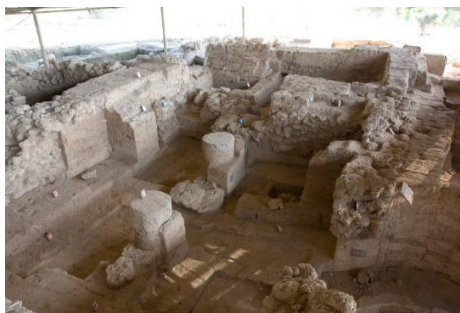
This is an ancient Philistine temple upheld by two central pillars

NB: These OT biographies were not written for our imitation, but for our learning, instruction. Sinners can learn from Samson what not to do with their lives.