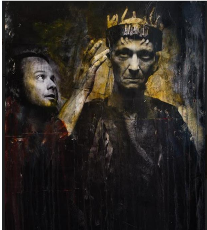
Rise of Abimelech